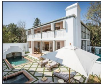
A stylish outdoor area for hotel guests to relax.