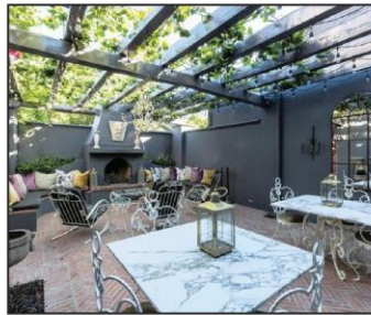
The Franschoek hotel's outdoor eating area.