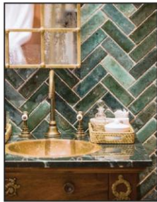
Detail in one of the bathrooms.