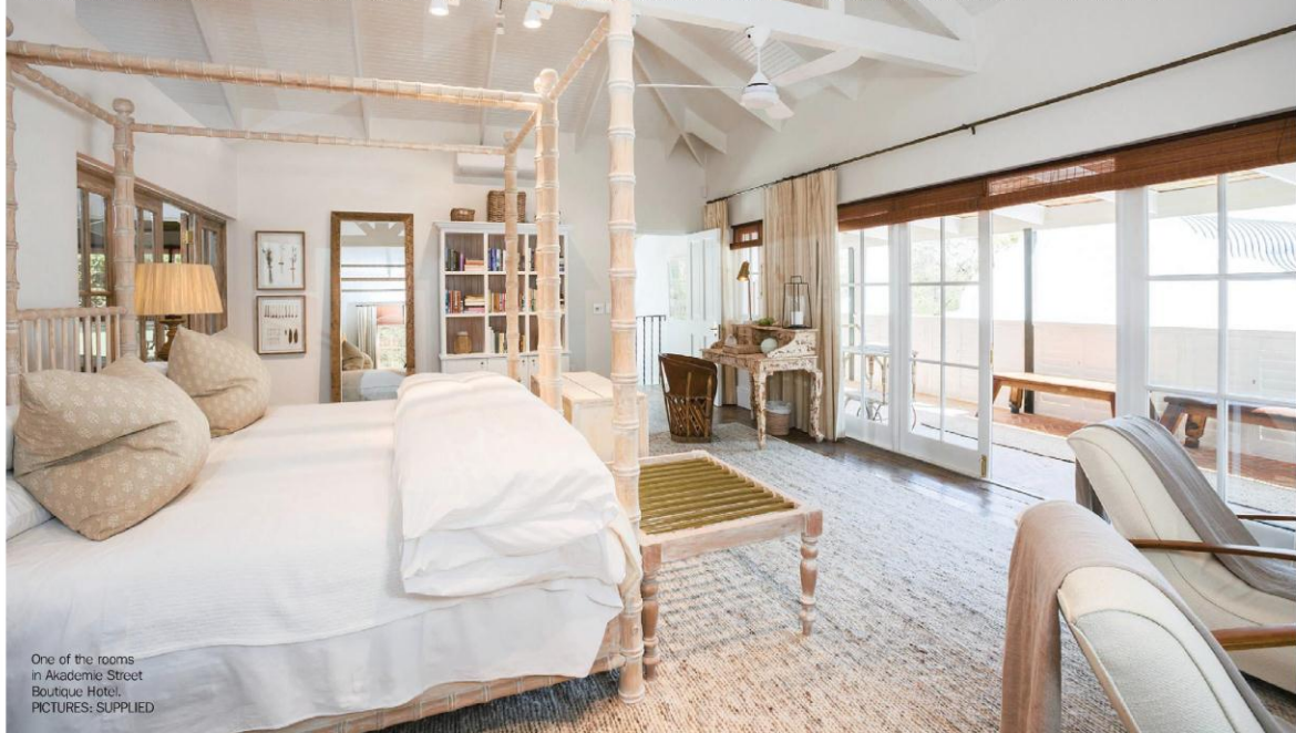
One of the rooms in Akademie Street Boutique Hotel.

pieces of history, including the train ticket used by the family to visit London from Oxford, where they were staying, the showroom brochure from which they selected the piano, and the original key to lock the keyboard. I arranged for it to be fully and sympathetically restored to its former glory. It now sits in our main guest lounge, and is played by our resident pianist. Its sounds fabulous, just like I assume it did back in 1929. What advice would you offer readers who want to recreate a similar style in their own homes? Don't be afraid to take risks with your design and decor. While it's okay to take inspiration from elsewhere, try to curate your own unique style by combining pieces from different eras. As long as it is done sympathetically, the results will be amazing.