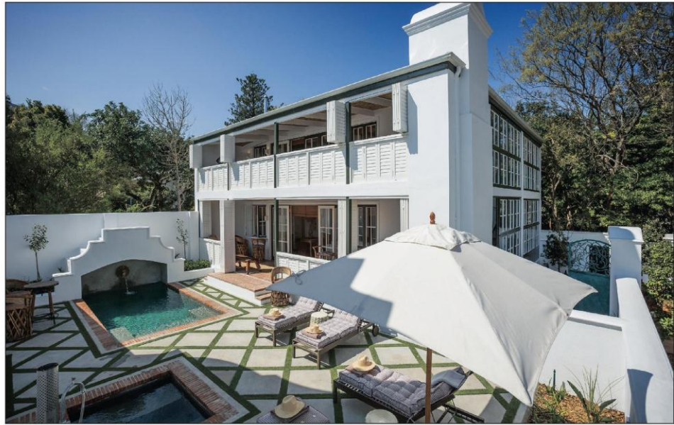
The Gelatenheid Cottage, a spacious two-storey country chic cottage, separated into A and B, offers privacy away from the main house.

Then there's Vreugde (joy), this exclusive garden cottage was once a storeroom which has been