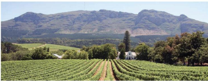
This material is not for sale or retransmission due to copyright.

STATISTICS PROVIDED BY private property www.privateproperty.co.za